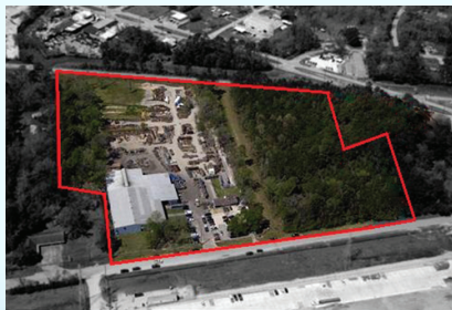
HUMBLE, TEXAS (CORPORATE OFFICE)

With over 20 years of experience manufacturing pressure vessel components, Forged Components Inc. gets the job done right 24/7/365 , providing emergency service for all shutdown & turnaround engineering projects.