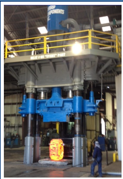
3,000 TON PRESS