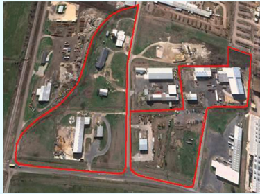
NAVASOTA, TEXAS FACILITY

FCI operates 24/7/365 , specializing in shutdown-turnaround projects and offering a one-stop source for custom forgings, heat treatment and machining services dedicated to ASME and API products since 1997, with 7 manufacturing facilities on 50 acres and over 250,000 sq. ft. under roof; ISO, PED and ABS certifications; an extensive raw steel inventory of carbon, alloy, stainless and nickel alloys, along with HF-N (Alky) and Chrome Moly's (API 934A, C & E) - very low J and X Factors. “ALL OF THE ABOVE ENABLES FCI TO OFFER SHORTER LEAD TIMES”