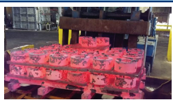
ACQUISITION FORGE USA