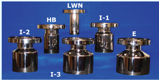
PRESSURE VESSEL FAMILY